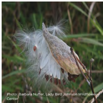
Mature fruit with seed