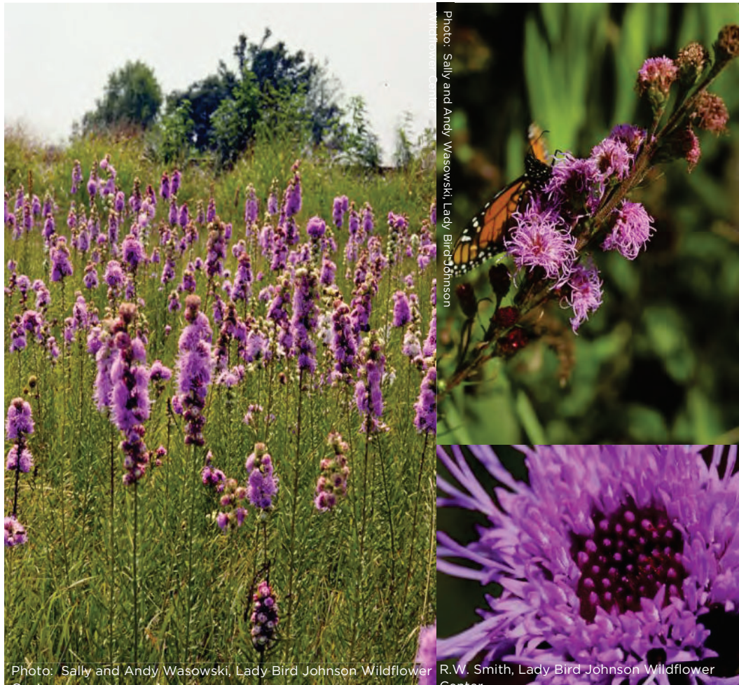
Full flowering/close-up of blooms